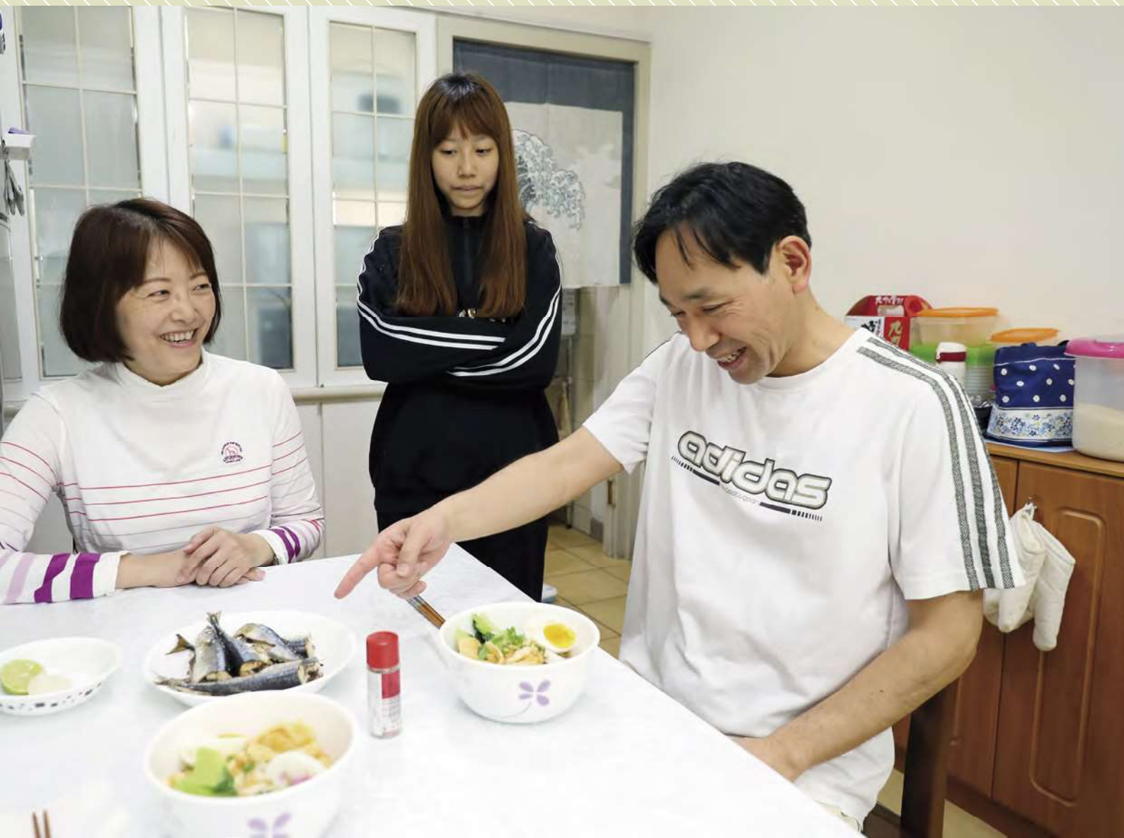
與家人一起是生活中最大的幸福。 Time with family is the happiest thing in life.