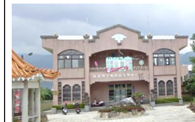
Made by Yilan County Fire Dep.